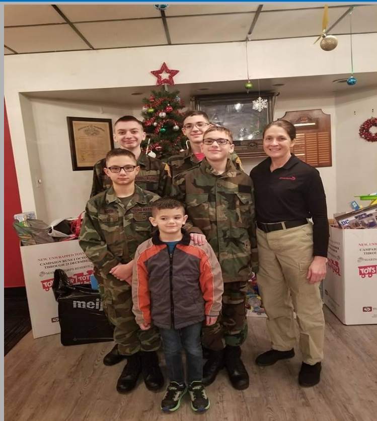
Young Marines of the Cpl. Stanley L. Moore Detachment were the first to gather to help the detachment in their Toys for Tots drive.